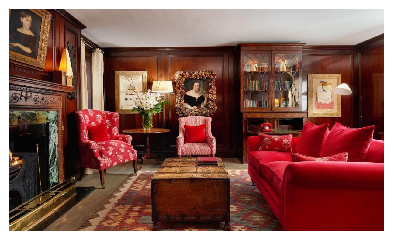
The perfect location in South Kensington's vibrant neighbourhood

The Pelham is set right in the heart of South Kensington's vibrant neighbourhood, a short walk from Kensington Gardens, offering the perfect spot from which to enjoy its array of dining, drinking and shopping options. Located opposite South Kensington underground station – directly connected to Heathrow airport – and a few stops from Piccadilly Circus and Oxford Street, it's the ideal starting point for discovering The Victoria and Albert Museum, The Natural History Museum or The Royal Albert Hall.