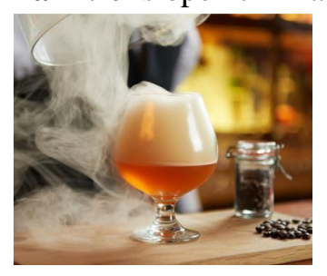
Bar 190 is open till 1 am from Monday to Saturday and till 10.30pm on Sunday.

A menu of small plates is served, from glazed lamb ribs with chimi-churri and yogurt to steak haché with toasted sourdough, gherkins and chutney, all available for pairing with the preferred cocktail.