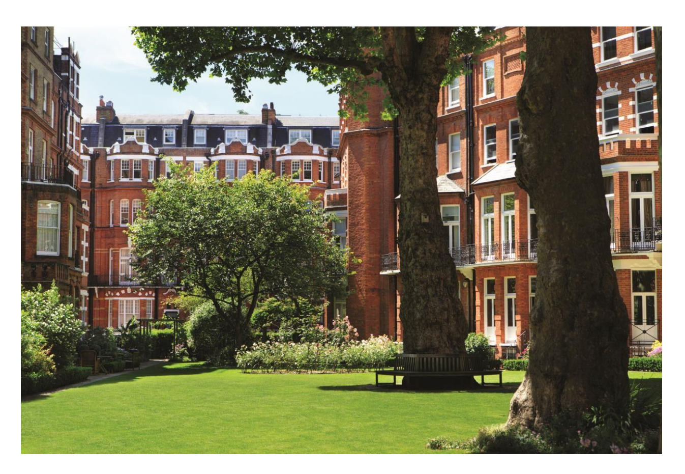
A stunning location overlooking Egerton Gardens

The impressive location in the heart of Knightsbridge, the lavish interiors and the quintessentially Italian hospitality have cemented The Franklin London - Starhotels Collezione as one of the most outstanding 5-star hotels in London.