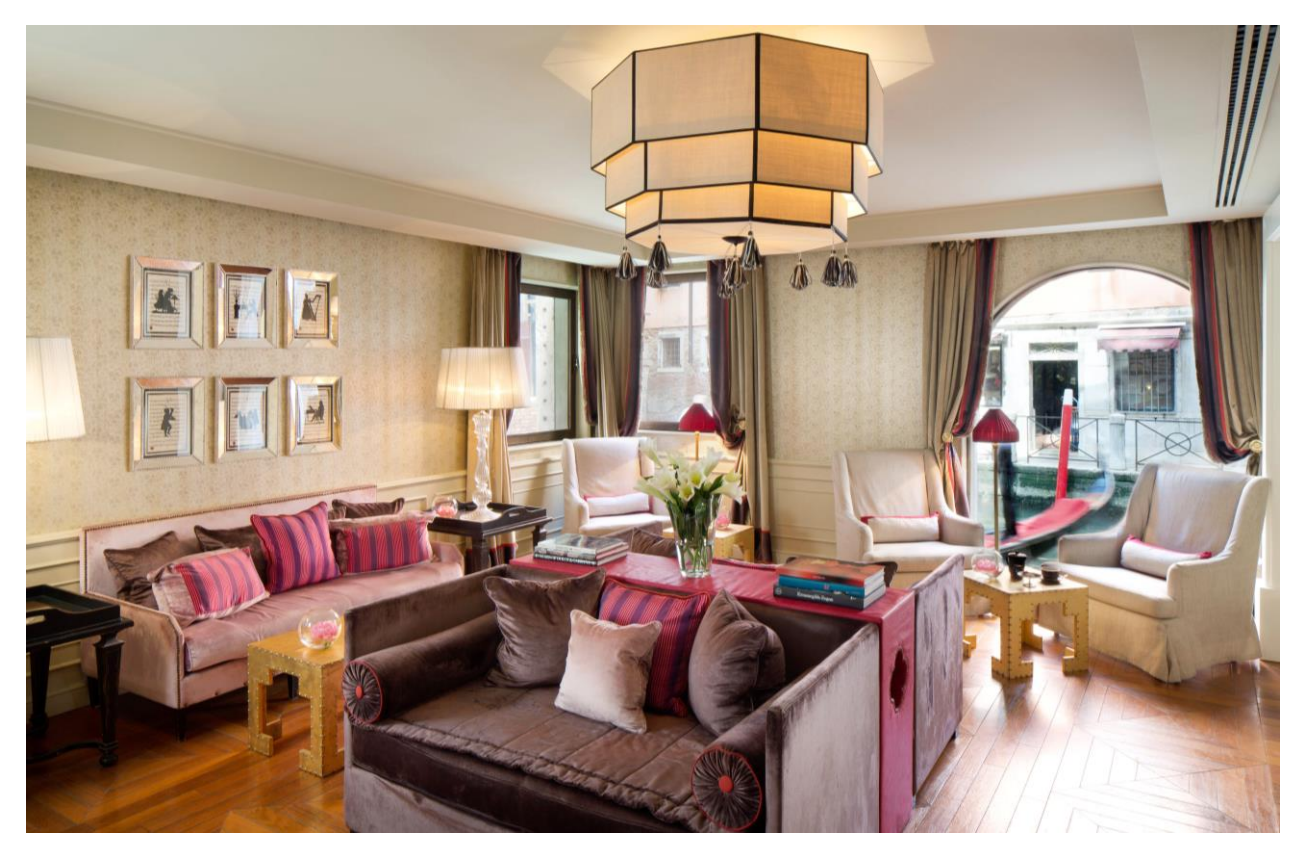
The altana: open air theater

Like the Teatro la Fenice, whose profile can be glimpsed from the hotel terrace, the Splendid Venice entertains its guests with a uniquely Venetian game of constantly shifting stage sets. The succession of rooms and alcoves on the ground floor gives way to unexpected views, cropped by the rooms and hallways of the upper floors, culminating in the altana Solana, a delightful system of decks and terraces typical of Venice: with nearly 200 square meters, distributed over multiple levels, this is the largest such structure of any hotel in the city. Once the refuge of ladies who wished to enjoy the sun, breeze and beauty of their city in private, today this system of terraces is open to guests throughout the day, especially at cocktail hour, with a classic Spritz or Bellini or the house signature "Laguna" cocktail, when Venice offers her most enchanting views, and the campanile of St. Mark seems so close that you could touch it.