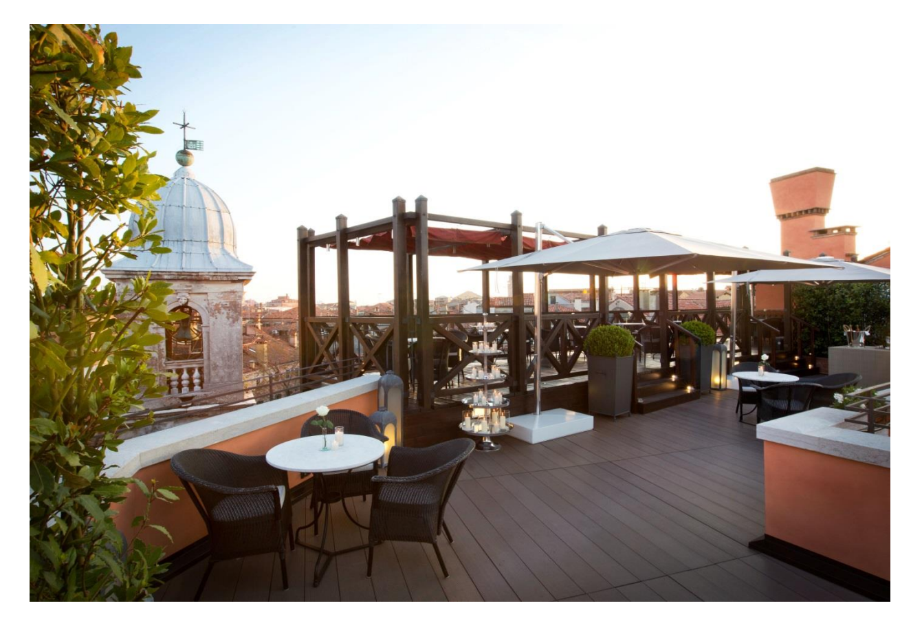
The altana: open-air theater

Like the Teatro la Fenice, whose profile can be glimpsed from the hotel terrace, the Splendid Venice entertains its guests with a uniquely Venetian game of constantly shifting stage sets. The succession of rooms and alcoves on the ground floor gives way to unexpected views, cropped by the rooms and hallways of the upper floors, culminating in the altana Solana, a delightful system of decks and terraces typical of Venice: with nearly 200 square meters, distributed over multiple levels, this is the largest such structure of any hotel in the city. Once the refuge of ladies who wished to enjoy the sun, breeze and beauty of their city in private, today this system of terraces is open to guests throughout the day, especially at cocktail hour, with a classic Spritz or Bellini or the house signature "Laguna" cocktail, when Venice offers her most enchanting views, and the campanile of St. Mark seems so close that you could touch it.