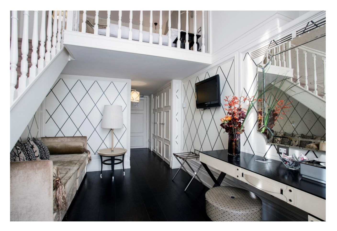
Duplex Junior Suite

The Duplex Junior Suites span 30smq on two floors and can comfortably accommodate up to three people. The large lounge downstairs is embellished with sumptuous silk and velvet curtains and offers a desk, a sofa and a flat-screen television. A comfortable bedroom and elegant marble bathroom are upstairs.