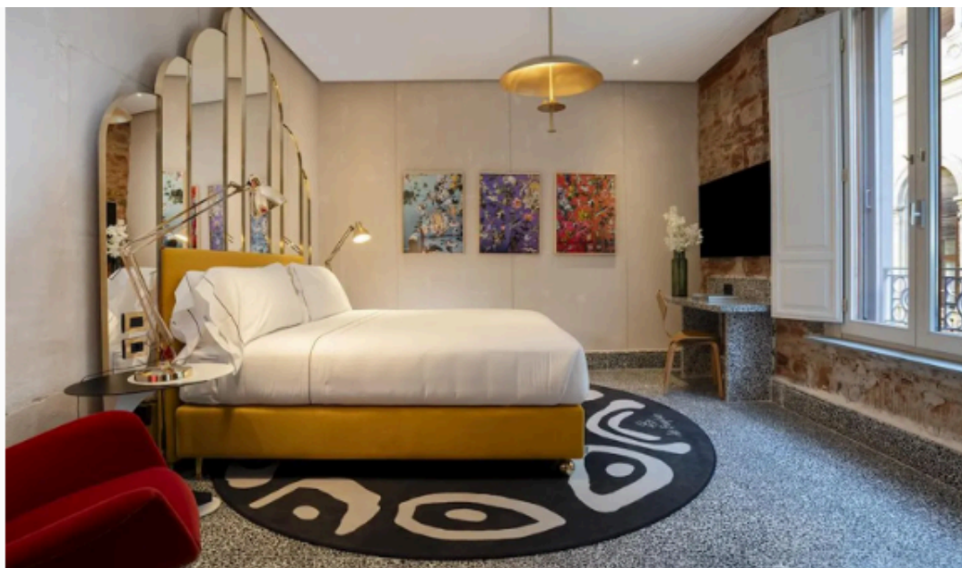
A suite at Calimala, Florence CALIMALA

Hotel Calimala , a hip four star that opened recently in the center of the old town, is arranged over two historic buildings. Accommodation includes 38 rooms in the east building and 65 in the west of which 4 are suites. The rooms are spacious and comfortable, with high ceilings and some have balconies. Decor is contemporary: exposed stone and tricolor terrazzo floors, modern furnishings and marble finishes. A double room starts from 300 euros in low season, 450€ in high season.