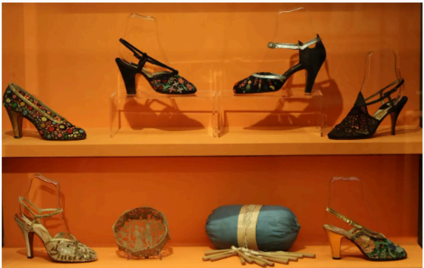
Ferragamo Museum, Florence

For a deep dive into the life and work of Tuscan fashion designer Salvatore Ferragamo, Museo Ferragamo provides a fascinating look at the incredible rise of a designer who came from extremely humble roots to become shoemaker to the stars. The exhibition details his early life and immigration to America, his first store in Hollywood in 1923 and his return to Florence where everything is made today. Ferragamo's creations are presented not only to highlight their value as works of art but to show their creator's skills as an entrepreneur and innovator, his passion for color and knowledge of the anatomy of the human skeleton and specifically the foot. The exhibition shows his exploration of new materials and the many sources of inspiration from the art world and ancient and contemporary culture.