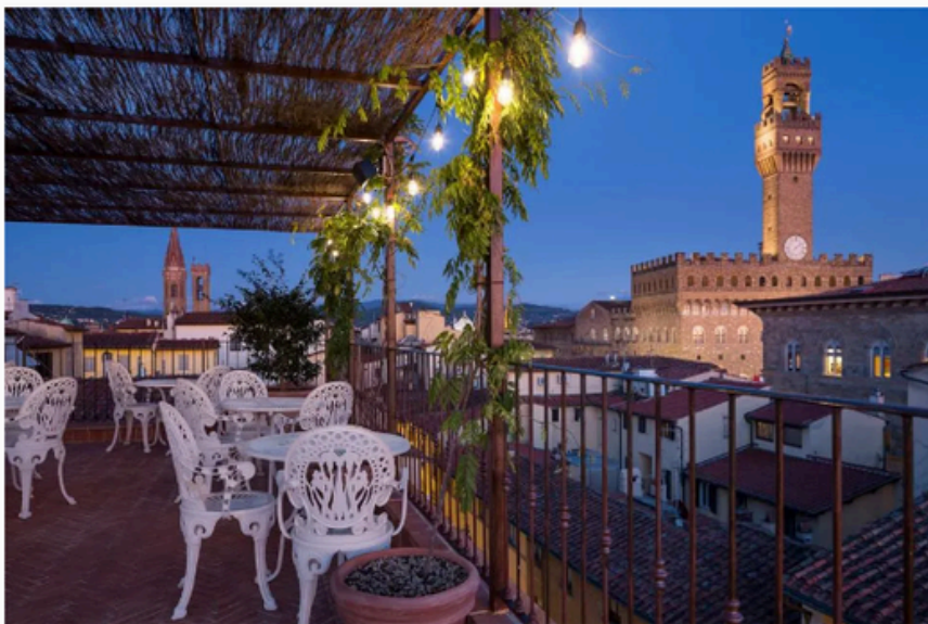
Angel Bar at the Calimala SHAI EPSTEIN

Meze at Calimala hotel features Mediterranean cuisine using typical Tuscan flavors, Sashimi, homemade bread and house dips, a 12 year old balsamic from Modena, spicy red pepper spread, green pepper and spicy herb spread, steak on a skewer and beef tartare are all delicious.