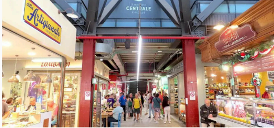
Mercato Centrale, Florence

Dating back to the nineteenth century and open daily from 9 a.m. to 12:00 a.m. Mercato Centrale is a huge fresh food market over two floors, frequented by both locals and tourists, with plenty of tasty Italian dining options too.