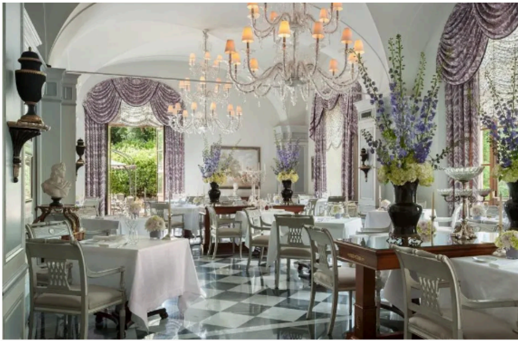
Il Paglio, Four Seasons Florence