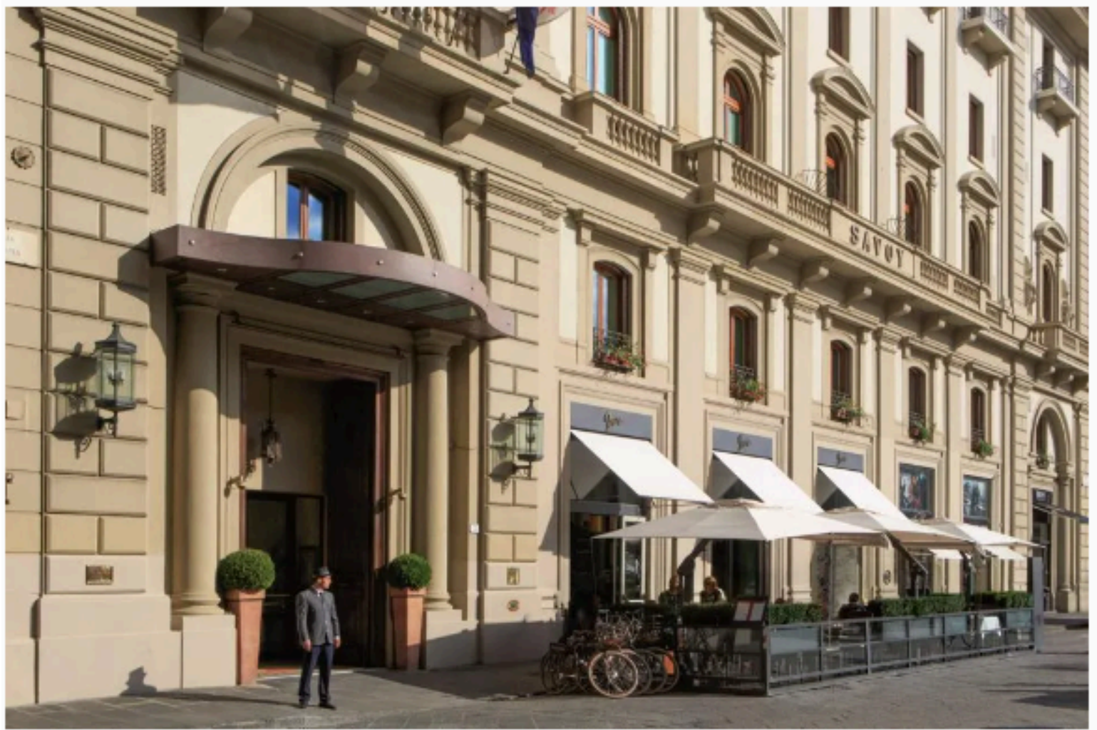
Hotel Savoy façade, Florence HOTEL PHOTOGRAPHY

Hotel Savoy a five star Roccoforte property, was designed by Olga Polizzi and Laudomia Pucci (daughter of legendary fashion designer Emilio). The interior shows off Florence's fashion heritage and its history, with signature prints, shoe motifs and antiques. There are 80 elegant rooms, including 30 suites, some with balconies, each with chic carrara marble and mosaic bathrooms. The excellent Irene restaurant serves breakfast, lunch and dinner. Double rooms start from 720 euros/night in low season.