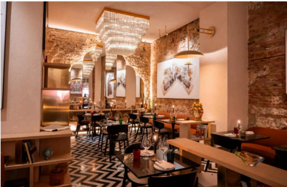
Meze at the Calimala MEZE

Meze at Calimala hotel features Mediterranean cuisine using typical Tuscan flavors, Sashimi, homemade bread and house dips, a 12 year old balsamic from Modena, spicy red pepper spread, green pepper and spicy herb spread, steak on a skewer and beef tartare are all delicious.