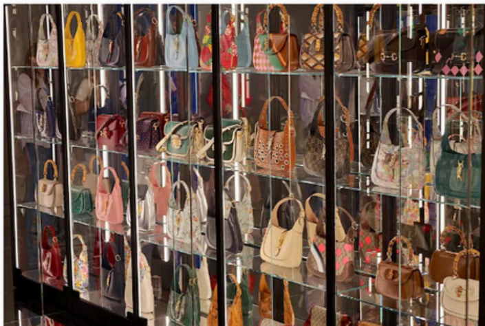
One section of the handbag room at the Gucci museum, Florence

For contemporary art, Palazzo Strozzi is a must. The current show, Fallen Angels , is a tremendous exhibition in every meaning of the word (the works are massive) by Anselm Kiefer. The Renaissance architecture of Palazzo Strozzi provides an excellent backdrop for new and historical works by the German artist, including a new commission created for the palace's internal courtyard, free for everyone to view. And if you're at the Strozzi, do see the painting exhibition nearby at Hotel Savoy. Abstract Perspectives: Annaya Sand's Tribute To Women runs until 20 May 2024 in the hotel's public spaces.