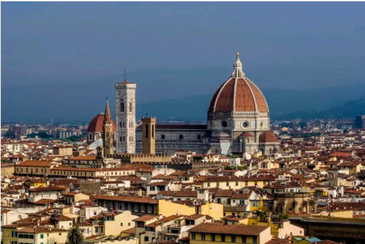
Aerial view of Florence from Piazza Michelangelo

Renowned for its rich history and stunning architecture, Florence is a must-visit destination for art enthusiasts and history buffs alike. From Michelangelo's David and the Duomo , one of the largest churches in the world with its famous Brunelleschi-designed dome, to fashion museums from Gucci and Ferragamo and fabulous Tuscan food (including gelato), Florence offers endless opportunities for exploration and discovery.