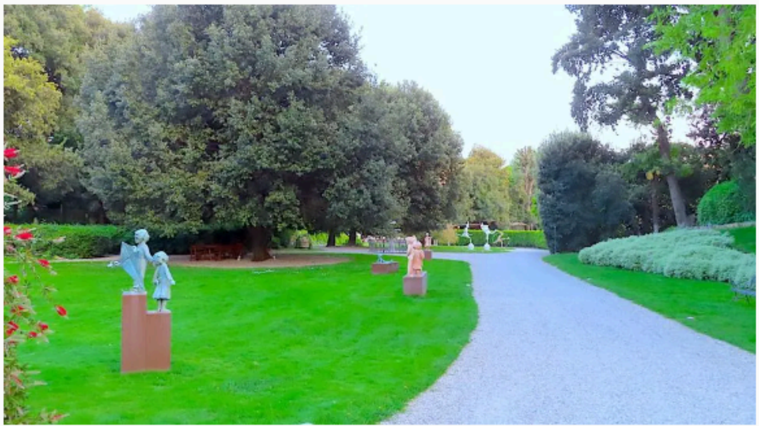
The gardens at Four Seasons, Florence

Just outside of the busy center is the Four Seasons , an oasis of calm, located in Florence's biggest private garden with statues, fountains and contemporary sculptures. The hotel, housed in the magnificent Renaissance Palazzo della Gherardesca, formerly a Medici property, has 116 individually decorated bedrooms with lovely antiques, pictures, silks, velvets and brocades.