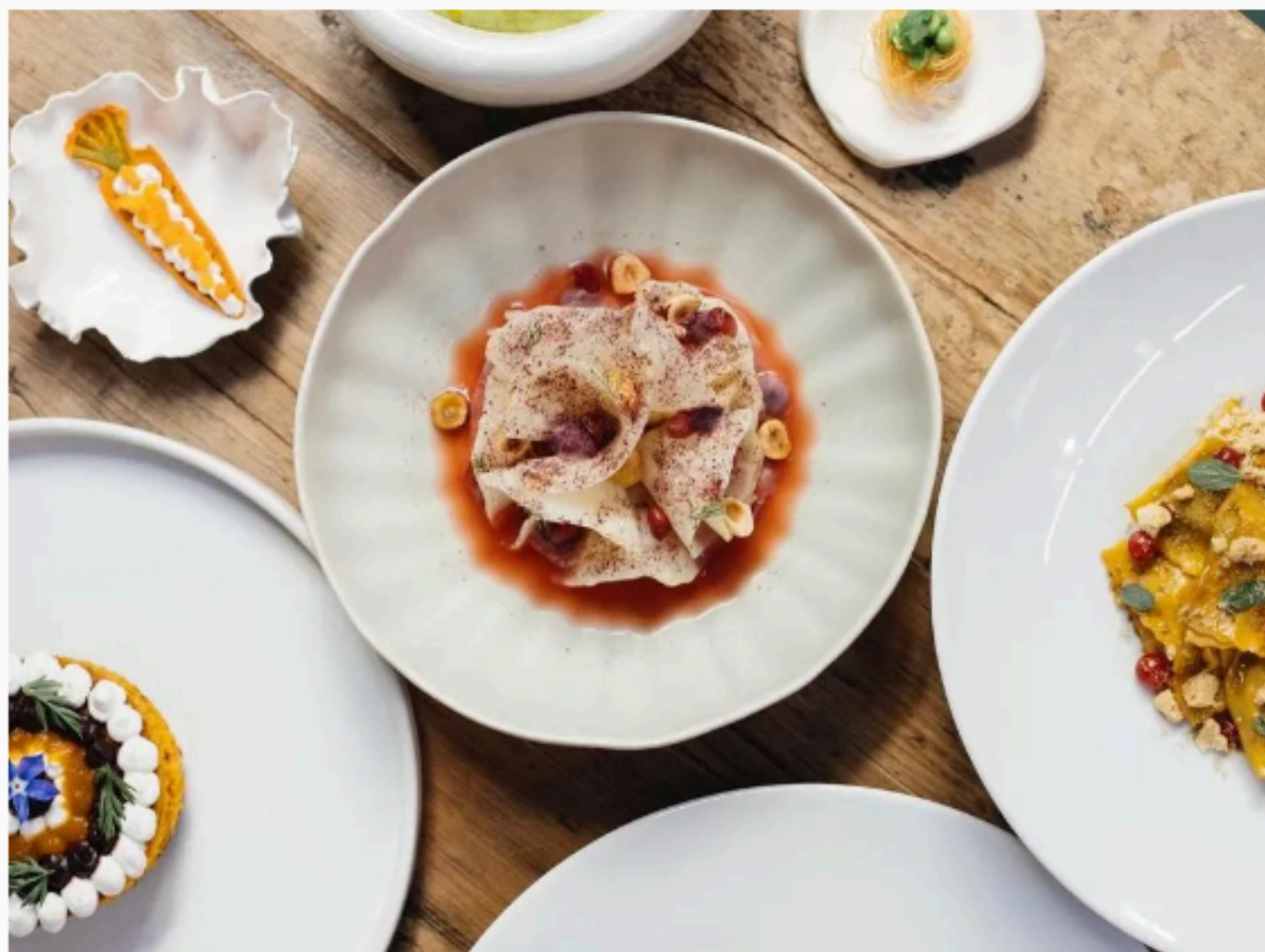
Part of the tasting menu at Nugolo, Florence NUGOLO

It's no surprise that Nugolo was featured in Stanley Tucci's CNN series Searching for Italy because what a delight it is, from its rustic Tuscan farmhouse decor and design with an open-view kitchen, to the stellar menu. The restaurant was founded by Nerina Martinelli, who is keen to preserve the different varieties of produce that are slowly disappearing. Her creative young chefs use seasonal and local ingredients to create imaginative dishes like Agnolotti di ossobuco and Fusilloni infused with black tea from juniper and rabbit ragu. Tasting menus are excellent and good value at 60 euros for five courses or 80 euros for seven.