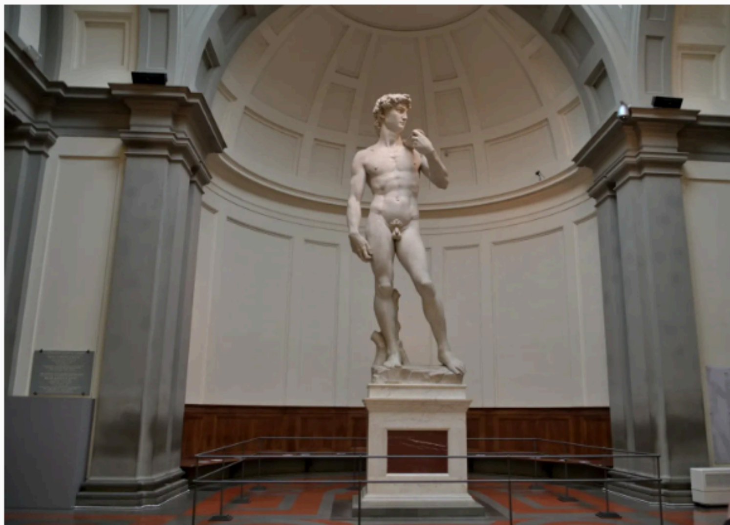
Michelangelo's David in Galleria dell'Accademia, Florence, Italy

After seeing the famous Duomo (free to enter), preferably early before the crowds descend, head to see Michelangelo's David in the Accademia , 17 feet high and made from a single block of marble. And don't miss the museum's other considerable Renaissance treasures by Sandro Botticelli, Domenico Ghirlandaio and Filippino Lippi. It's best to use a tour company for tickets as the queues are madness. A good one is Get Your Guide where you go in an organised, timed queue with a guide who also offers interesting commentary.