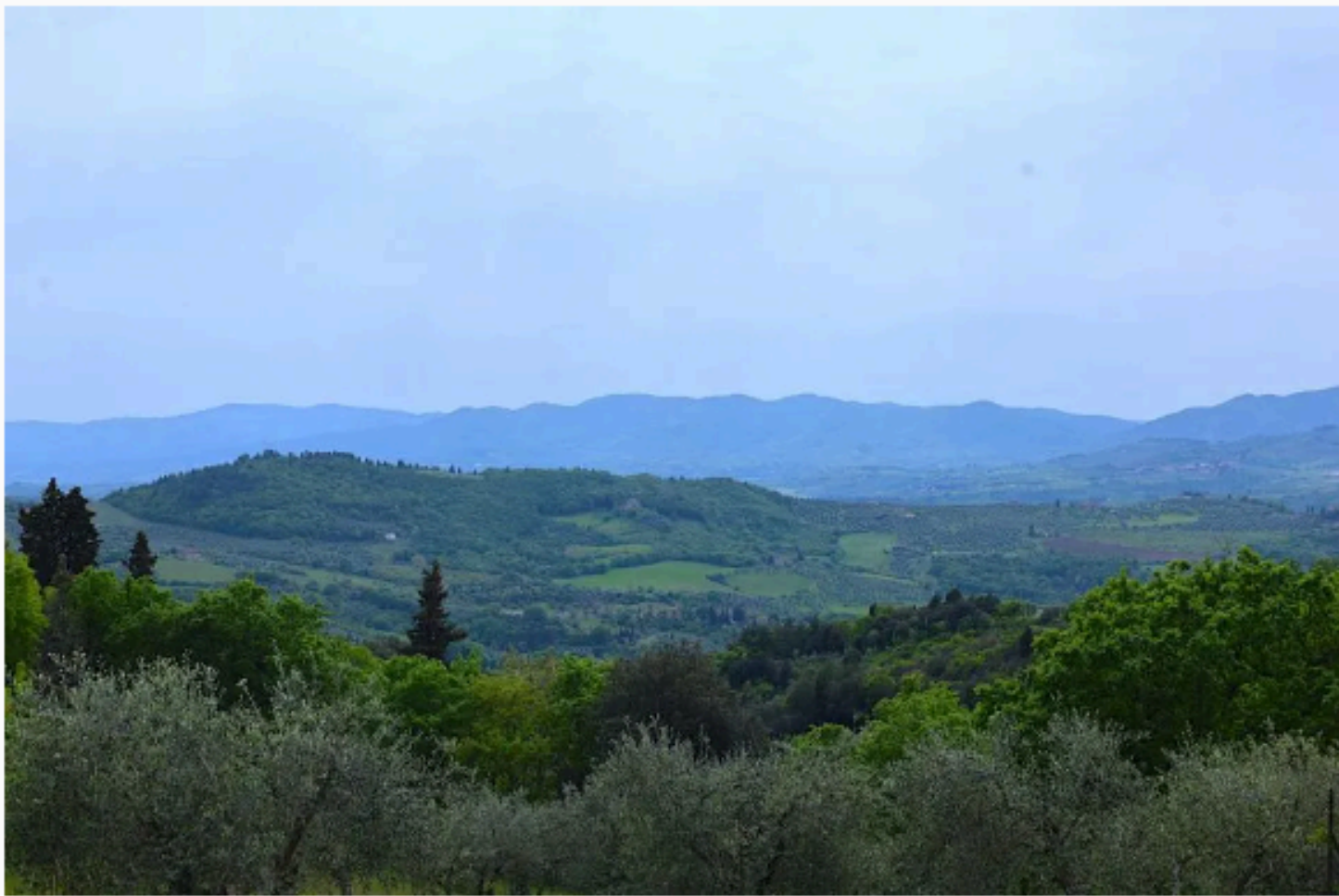
View of the Tuscan hills just outside of Florence at Podere Castellare

For an afternoon excursion or even a stay, just outside of Florence, head to the glorious Tuscan hills to visit Podere Castellare , an agriturismo with 12 boutique guest rooms, restaurant and a pool. The Podere also houses a micro gin distillery, Peter in Florence which offers daily tours. Peter in Florence is a London dry gin, created where the world's best juniper grows. The gin is a carefully crafted blend of 14 botanicals, including the Iris flower, a symbol of the city of Florence. Book a distillery tour to see how the gin is distilled in a modern designed version of the classic 1831 Carter Head still, using 100% natural botanicals and ingredients.