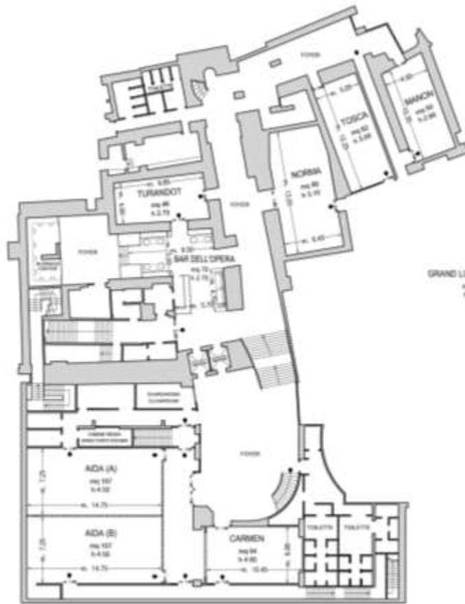
Piano -1 / Basement