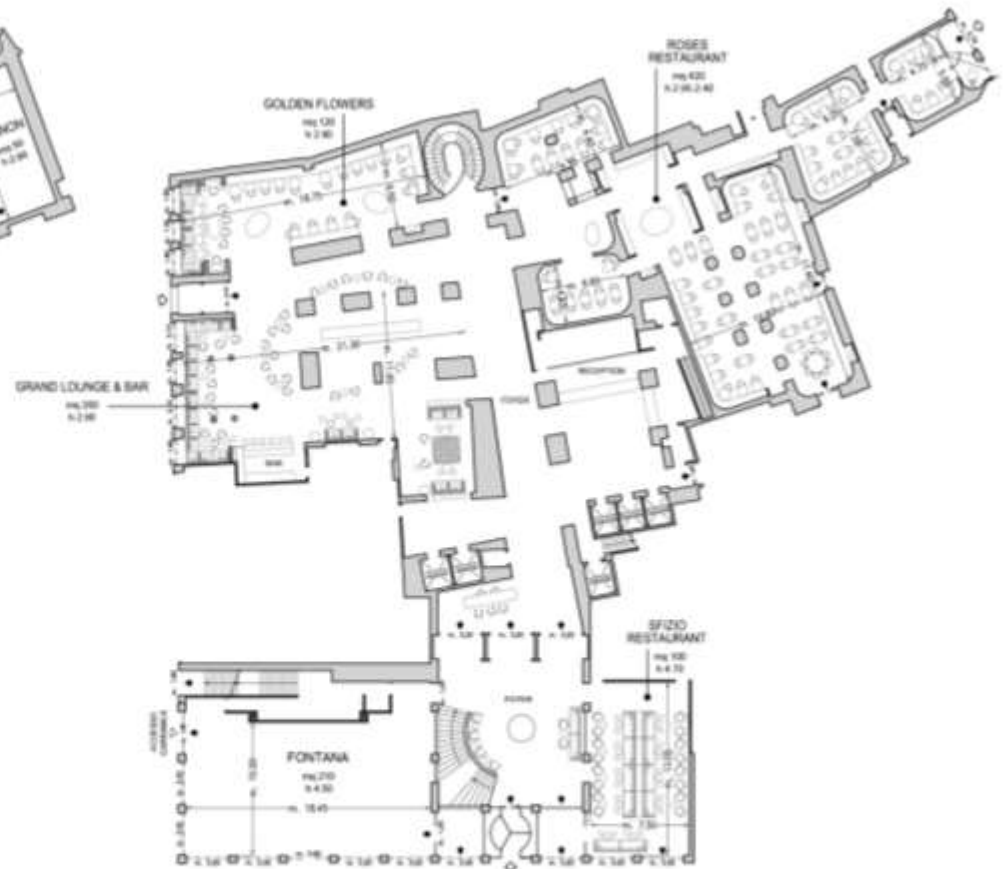
Piano Terra / Ground Floor

8 meeting room fino a 300 persone / 8 meeting rooms up to 300 seats