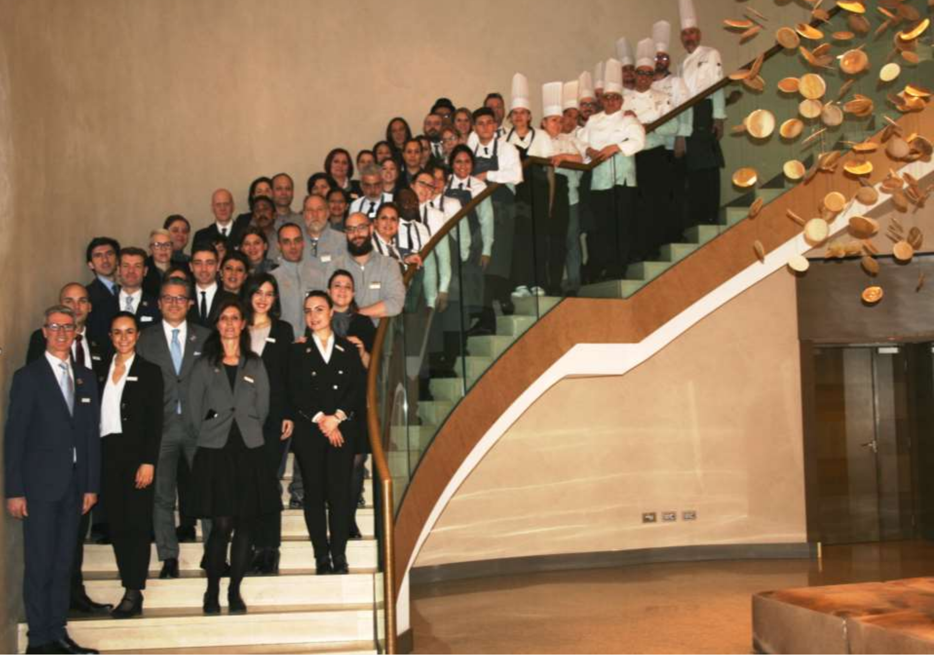
Milano, Rosa Grand – The Team