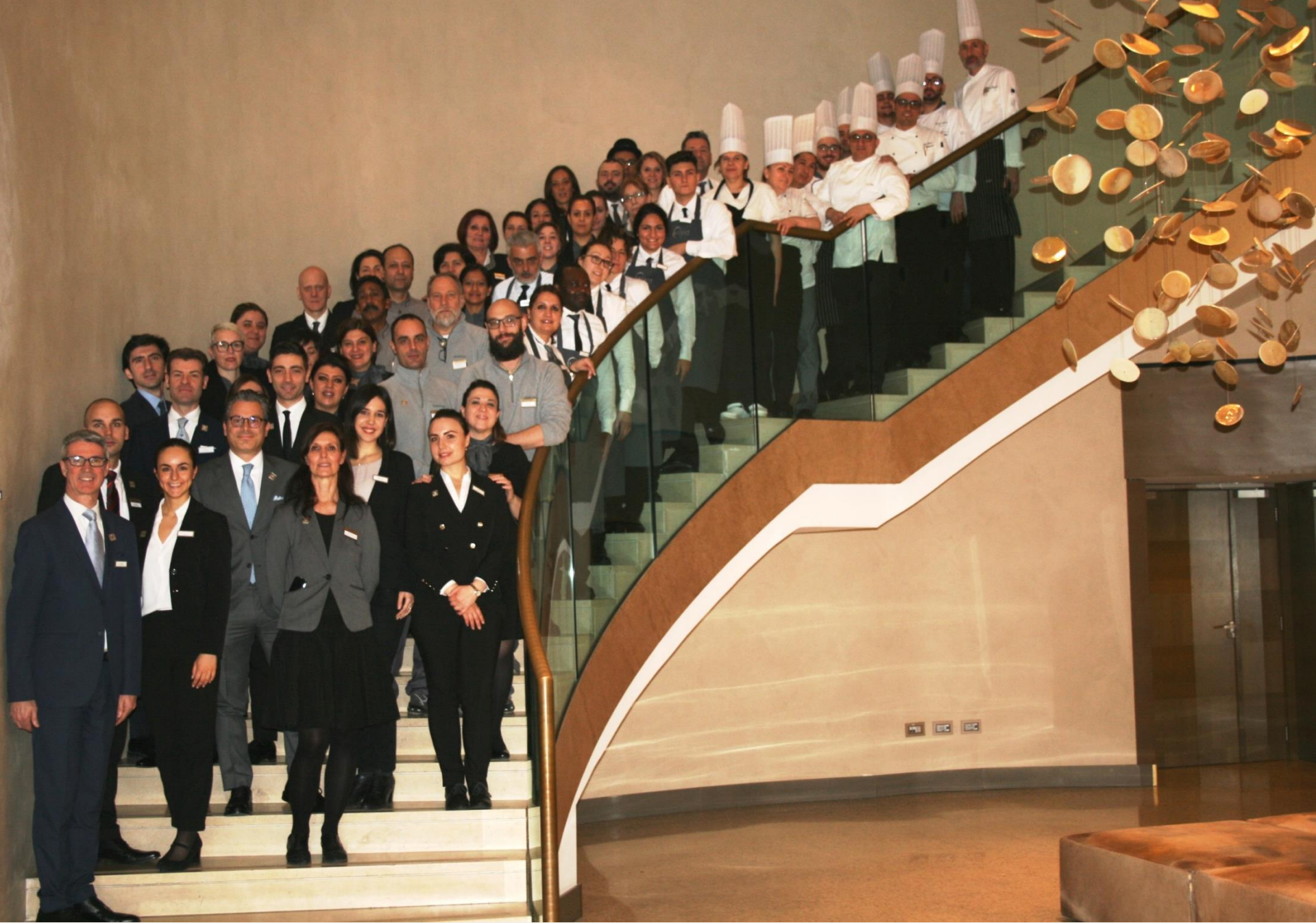
Milano, Rosa Grand – The Team