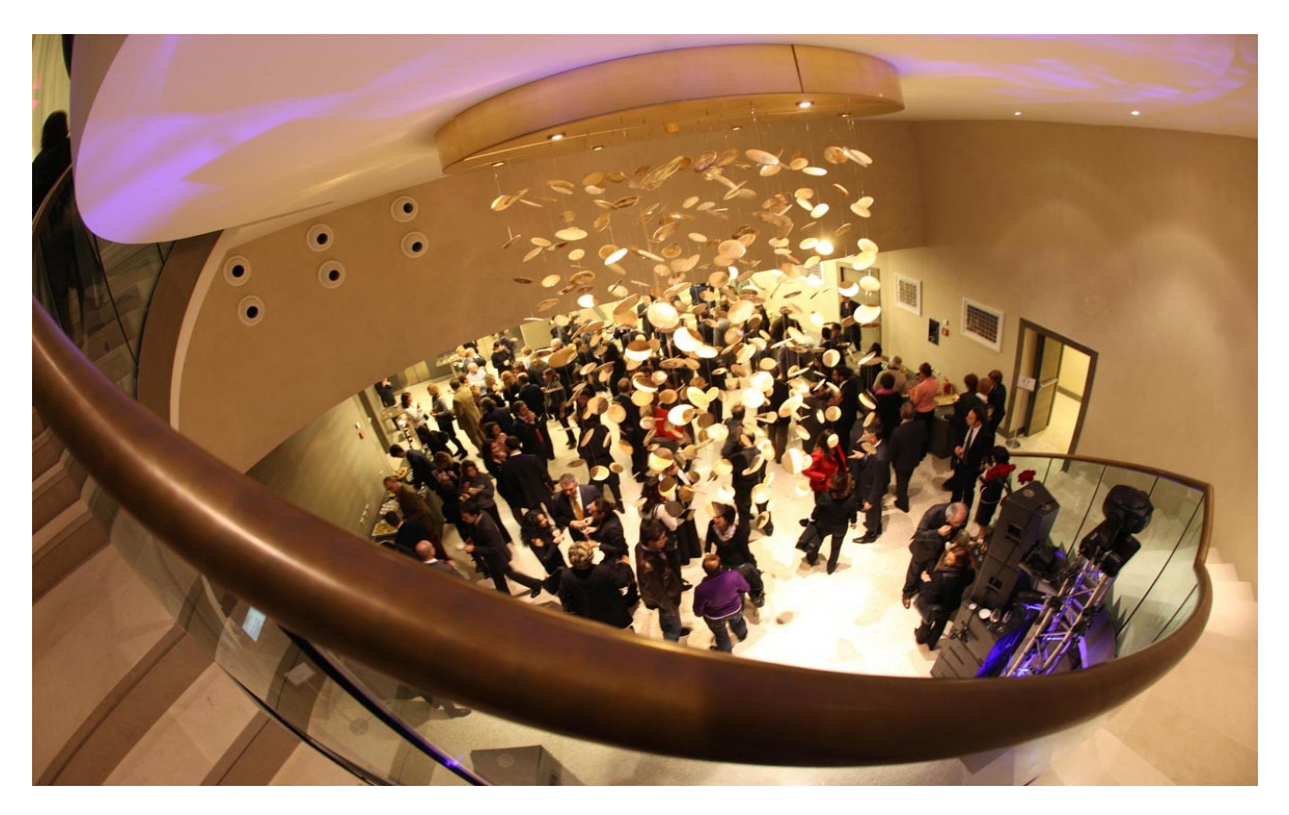
Disco music in the congress centre foyer during a preview of mosaics by Maurizio Galimberti for the Milan Expo 2015. 40 linear metres of strategically distributed buffet tables, the "Roses" restaurant and two bars offered guests the widest possible choice of food, from the most traditional to the most innovative.